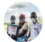
Responding to Emergencies