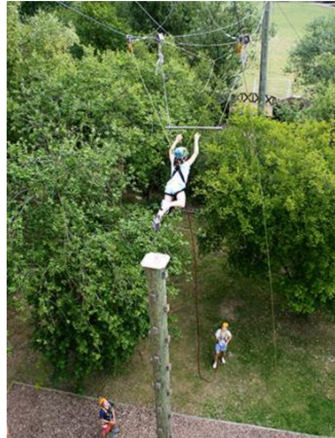
Leap of faith