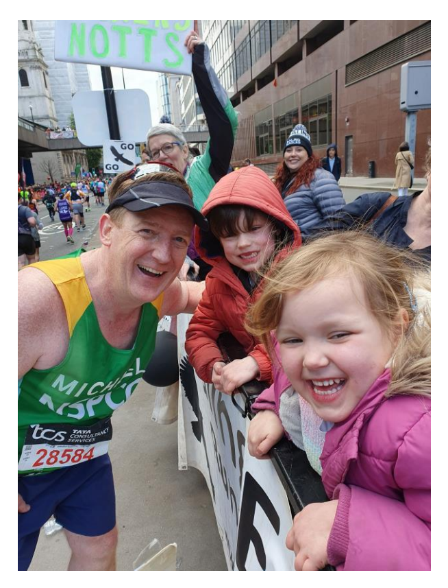
\ensuremath{ 1 \ } - And look who I bumped into along the course!